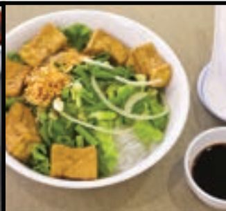
Tofu(Dry)Clear Noodle w/ Veggies (Side Soup)