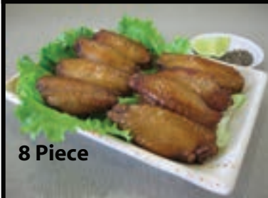
8 Piece Chicken Wings