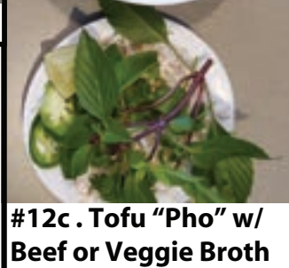
#12c. Tofu "Pho" w/ Beef or Veggie Broth