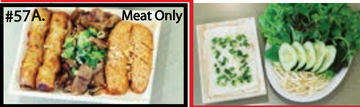
#57A. Meat Only

Extra Banh Hoi ONLY- Thin Rice Vermicelli sheets Extra Vegetable (LETTUCE, MINT, BEANSPROUTS, CUCUMBERS)