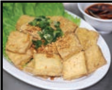
16 Piece Fried Tofu 8 Piece Fried Tofu